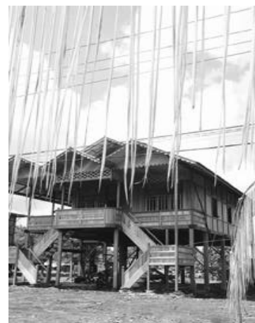
Figure 1. Minahasa Vernacular House

Minahasa area is an area that also has cultural heritage in this case residential houses as in other regions in Indonesia. This cultural product is one of the many cultural heritage that continues to be developed in Minahasa area. As a superior cultural product, the existence of this traditional house actually begins to feel vague. Because it must be admitted that many indigenous Minahasa cultures have had to give up on the times, the influence of globalization, and the lack of awareness to the importance of a cultural tradition, become the driving force behind the vague existence of Minahasa cultures. This becomes interesting to study because the identity of a human or group interface will be seen from the existence of the human or group culture. Something is missing from Minahasa culture, especially in the existence of Minahasa house which at this time should begin to enter the golden era because it has been produced in a modern way and marketed vigorously. It is interesting to be a study material because as one of Minahasa handicraft products, this Minahasa house, has also been seen as a cultural product. As it is mentioned in the problem statement, there is currently less special characteristics of a Minahasa house which confirms that this product is the result of Minahasa culture.