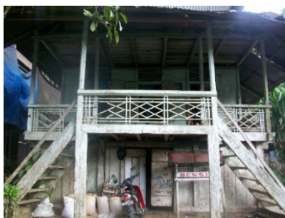
Figure 7. The stairs that become the main characteristic of Minahasa vernacular house today

people to make Minahasa house as a more attractive residential home which makes them then begin to include form variations. This is then seen as an accommodative attitude towards the development and desires of the community, but it also makes Minahasa house even more blurred in terms of identity.