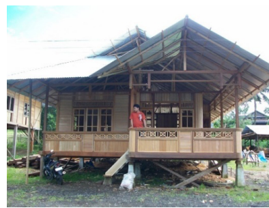
Figure 8. Minahasa vernacular house in Woloan village, Tomohon. The roof variations with the addition of a shield form to cover the part of the terrace, and the number of stairs on the front which only has one ladder

Facade as a representation of the philosophy and worldview of Minahasa community can be a medium of imagining Minahasa culture. This imaging process requires media that can revitalize the cultural facade of Minahasa vernacular house into a part of Minahasa cultural products. The position of Minahasa facade as a product of the past