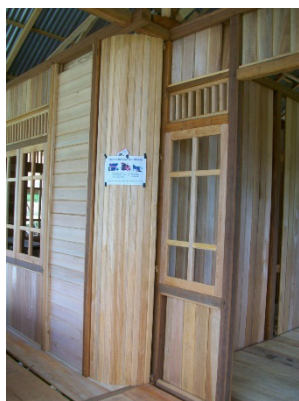
Figure 9. The installation of a wall board that overall had been installed vertically, began to be combined with horizontal installation.