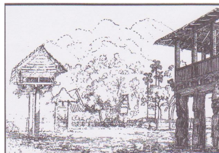
Figure 2. Sketch of the 1824 Sonder House by A.A.J. Payen.

all traditional houses in Indonesia, most of it is used because it is simple and easy to make.