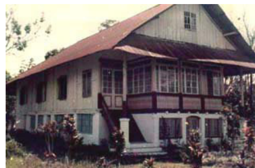
Figure 4. Houses with poles and under space made from concrete

The models of these houses were later known by the community as a form of Minahasa vernacular houses. In its development, the shape of this house began to use two stairs which were placed in the front of the house which Minahasa community believed to be a way to inflict evil spirits who wanted to enter the house where when the spirits climbed on one side of the stairs, they would immediately descend on the other side of the stairs. In the model of this house also began to be known as the term of attic ( soldor ). It is the space under the roof which functioned as a place to store food, but also had another function as a place to perform rituals in this case was believed to be a place for ancestors. In the attic/ soldor ritual function to be a place to store the results of mengayau which was believed if it was led inside the house, the wisdom and power of the owner will remain in the house and it can be owned by the homeowner. Another concept of Minahasa vernacular house in the structure of the roof, the house, and the under space itself developed from the concept of three worlds, namely the upper, middle and under world. The model of Minahasa vernacular house in the form of a stilt house also provides a space under the floor of the house which was used by some families as a warehouse but by many