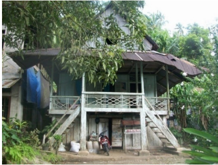
Figure 5. Minahasa vernacular house in Sawangan village

for poles. Cempaka wood is for the walls and floors. Nantu wood is for roof frames (Walukow, 2010: 52-53). For low economic level people, they use petung bamboo/ bulu Jawa for poles, roof frames and nibong for the floor and also for the walls.