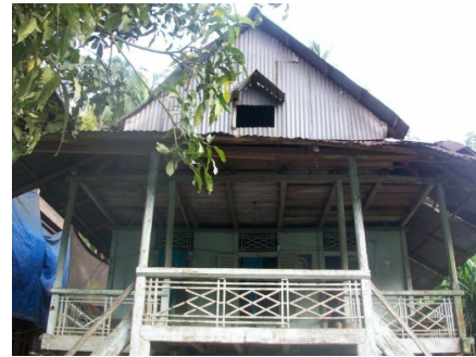
Figure 6. The roof shape of this house is one of the main characteristics of Minahasa traditional houses

The existence of this house is one of the houses in the traditional category that still survives. According to the owner, this house is a family home that has been passed down in generations. There have been at least three generations living in this house, and he is the third generation. This house was built by his grandparents around the 1930s. The interesting thing about the existence of this house is that we can find the characteristics of traditional Minahasa vernacular house. The shape of the roof which is a combination of saddle and shield with window openings on