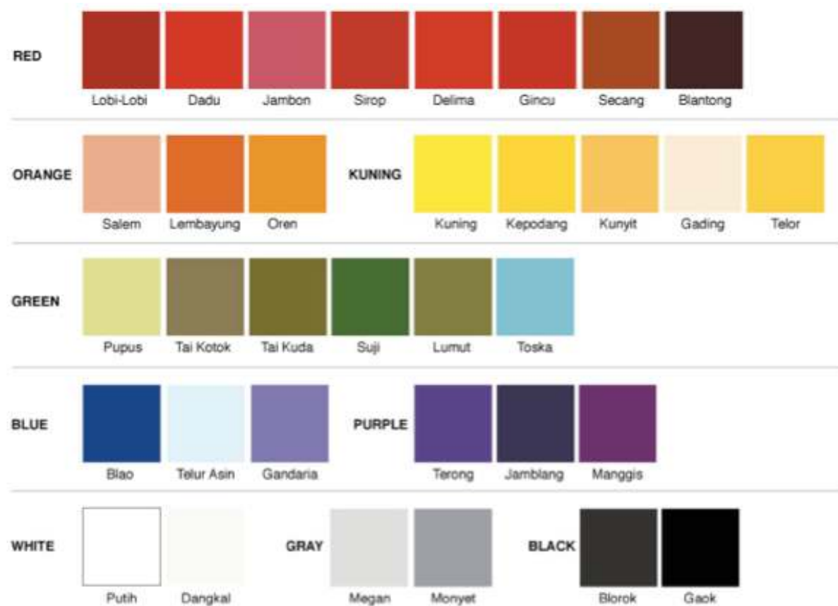
Figure 1. Color names of Betawi

for black category. Referring to the color's name of Betawi above, then it can be disclose that selection of nature objects (animals, plants) and artifacts surrounding community that used most. It means that Betawi life refers to reality around them. Nature and culture inspire Betawi's life.