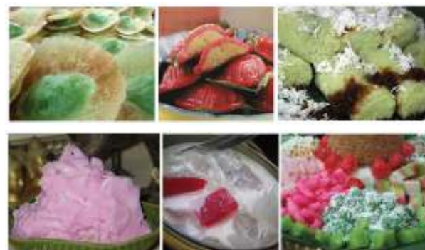
Figure 3. Betawi Tradisional Snacks

Some Betawi traditional snacks such as put, ku , cendil , ape , ongol-ongol , putu mayang , geplak wajik , pacar cina and beverage such as es doger , bir pletok , es selendang mayang , wedang ronde are mostly using dadu , jambon , and green colors.