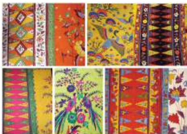
Figure 4. Betawi Batik jajanan-tradisional-yang-hampir.html )

Betawi textile in the form of sarongs and traditional cloths (wedding gown, bridesmaid uniform, kebaya abang none , dancer clothes, lenong uniform, and musical accompaniment) always use combination of many bright colors (colorful) such as dadu , green, yellow, jambon , oren , blue, black, and white.