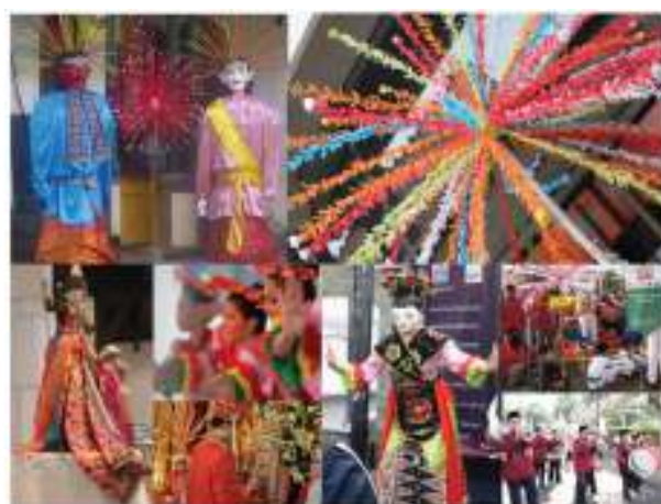
Figure 5. A festive color in Betawi Culture

Likewise with decoration of Betawi art ceremony such as wedding ceremonies, circumcision, performing art, and dancing there are constantly present an ondel-ondel and kembang kelape . The combination of bright colors always use for both decoration. In general the color combinations of dadu , jambon , oren , yellow, blue, green, and white are on kembang kelape .