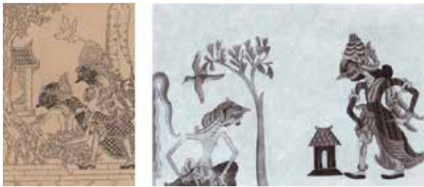
Figure 5. Pawukon visual of Wuku Tolu by R.M. Soelardi is categorized as “ aèng ” because Wuku Tolu does not face its deity Batara Bayu (Left figure source, foto source of Pawukon 3000 book, by Hermanu, 2013: 72). Visual comparison of pawukon wangun , which is Wuku Tolu facing Batara Bayu (Right figure source: scan of Pawukon book, by Sindhunata and Hermanu, 2003: 33)