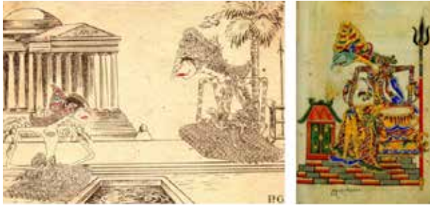
Figure 4. Wuku Kuwalu , pawukon aèng visual, is a wuku and the deity two dimensional shape ( wangun visual of loro-loron-ing atunggal ) combined with supporting figures in three dimensional shape, and the building shape is not of Javanese origin but of Roman, this figure is presented in Alamenak Waspada published in 1955 in Yogyakarta (Left figure source: scan Almenak Waspada , 1956: 117). This figure can be compared to house visual of Wuku Kuwalu using Surakarta style with Javanese style building (Right figure source: http://www.anom-suryaputra.id/2015/01/wayang-dan-simbol-wuku-astrologi.html : downloaded September, 12, 2016)