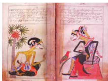
Figure 1. Wuku Wayang