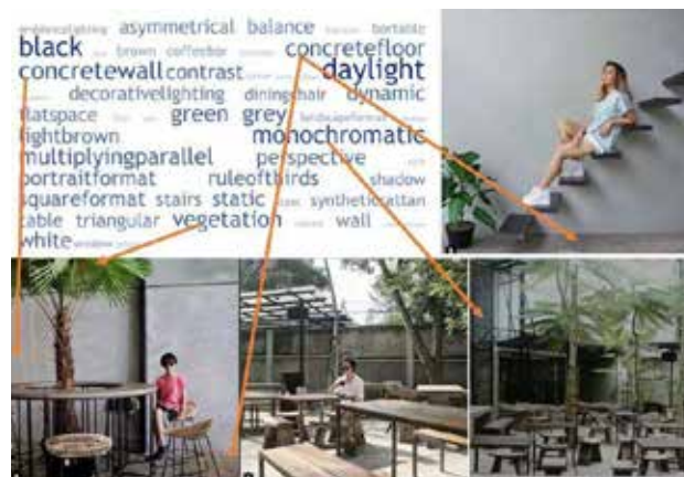
Figure 3 Word cloud text analysis result for Mimiti Coffee and Space

Having been visited by Indonesian president Joko Widodo (tribunnews.com, 2017), Sejiwa successfully attracts peo-