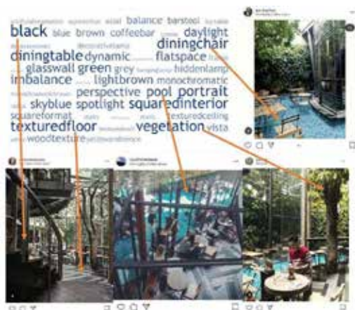
Figure 2 Word cloud text analysis result for 180 Coffee and Music

structure frames, so the significant elements shown on the photos of 180 Coffee and Music are the textured floor and the vegetation, which can be seen on Figure 2.