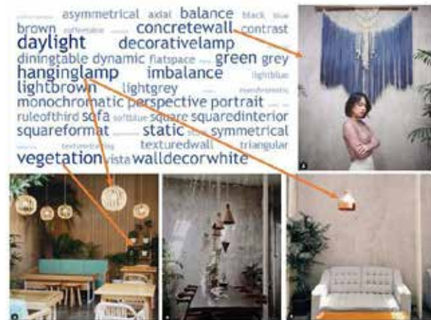
Figure 5 Word cloud text analysis result for Sydwic

patterns from many interior elements, such as wall decorations, varieties of hanging lamp armatures and vegetations, and the use of multiple colors with pastel tone on the furniture.