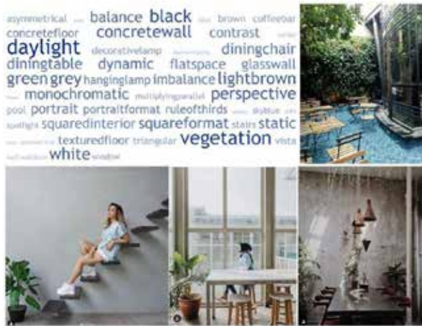
Figure 6 Word cloud text analysis result for all coffee shop samples

in a frame is what is needed for a self-expression. Thus, coffee shops that have this interior setting are preferred to become a photography object which relates to the need of self-expression in today's culture.