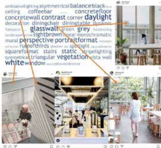
Figure 4 Word cloud text analysis result for Sejiwa