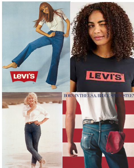
Figure 1: The role of photo models (brand ambassadors) used in Levi's advertisements before being replaced by images created with AI technology

“In my view, as an effort to persuade in promotion or advertising, the existence of a public figure model ambassador is still important or necessary for the appeal of advertising and is an effort to persuade potential consumers. So, if the advertising model is made with AI, I don't really agree (sreg)....” (Interview, 9 June 2024).