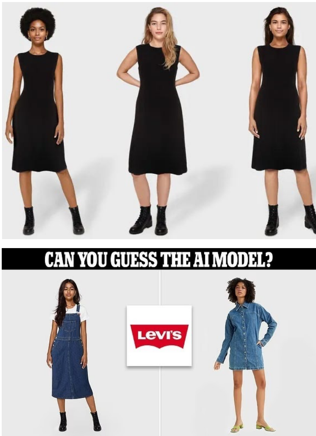
Figure 3 and 4. The models in Levi's fashion product advertisements were created using AI technology. AI technology can visualize hyper-realistic models, hoping customers can choose the desired fashion items that suit their desires, whether in terms of body type, age, size, or skin color.

Artificial Intelligence (AI) technology has been able to create model images in Levi's advertisements and replace the profession of photo models that were previously used. Artificial Intelligence, a system or machine that imitates human intelligence to perform tasks and can continuously improve its abilities based on the information collected, is said