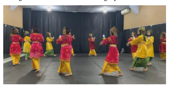
Figure 19. Dancers with a large circular floor pattern