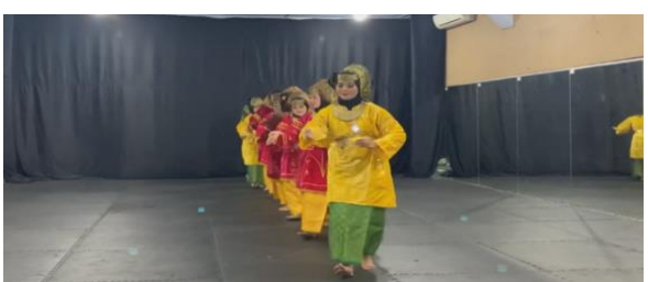
Figure 15. Dancer with a straight-line floor pattern