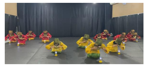
Figure 11. Dancers salute