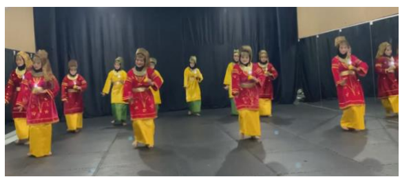
Figure 24. Dancer with swinging movements