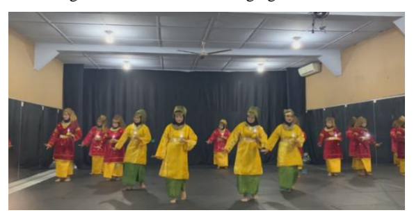
Figure 25. Dancers perform a floor pattern of closed bamboo shoots