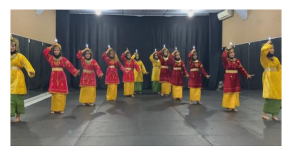
Figure 17. Dancers with lights moving overhead with a floor pattern of bamboo shoots