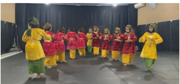
Figure 16. Dancers perform the floor pattern of bamboo shoots