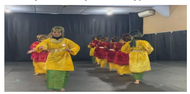
Figure 14. Dancers with a second-row floor pattern