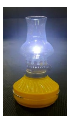
Figure 9. Wandru Ganefo (Teplok Light)