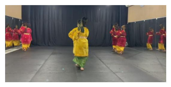
Figure 26. Dancers make movements to leave the stage.

The first process to reconstruct dance is to dig up movements that have long been lost and then rearrange them so that the various existing movements can be organized and whole again through the composition process. Dance artists use traditional movement patterns and develop these movements to make them look more beautiful. The reorganization of this dance was carried out to recall a dance that had long been lost and packaged so that it could function again and be recognized by the supporting community. In this research, there are many developments and changes to existing movements, including movements that provide an element of beauty. This reconstruction uses a previously existing repertoire of movements without changing the values and essence contained in the Giri dance; in other words, the reconstruction is only in terms of its form without changing the content contained in the dance.