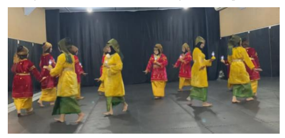
Figure 23. Dancers with small circle floor patterns.