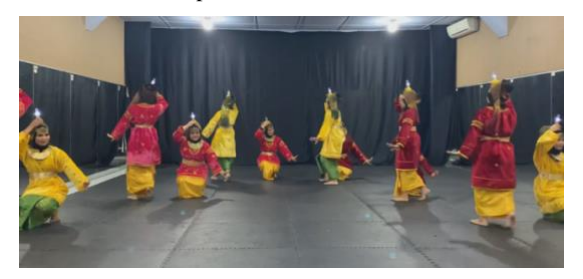
Figure 18. Dancer with a rotating squat movement