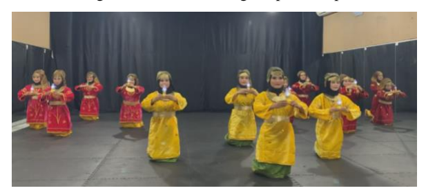
Figure 13. Kneeling dancer standing process