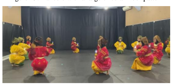
Figure 20. Dancers perform squatting movements with lights on the backs of their hands