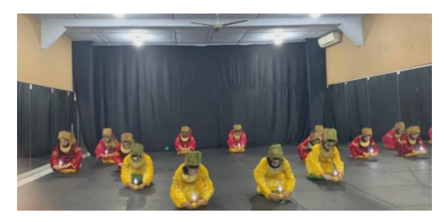
Figure 12. Dancer taking a teplok lamp