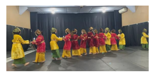
Figure 22. Dancer with a diagonal line floor pattern