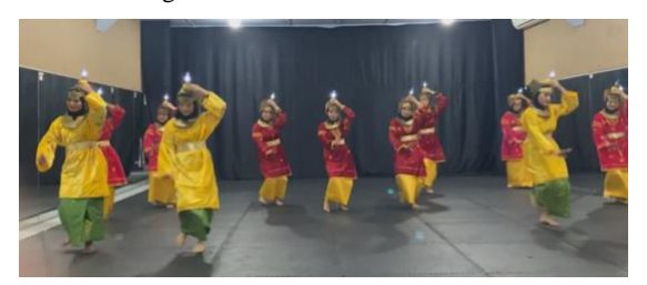
Figure 21. Dancers perform overhead light movements