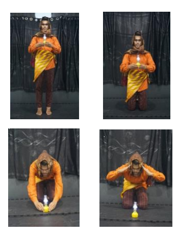
Figure 4. Manembah Movement Process (Respect)

The second hand is opened wide at shoulder level, holding a teplok lamp in front of the chest while the feet stand on their knees. The body bends forward while placing the teplok lamp on the floor, then greets with both hands at eye level. After greeting, the lamp is taken, and the standing process is carried out.