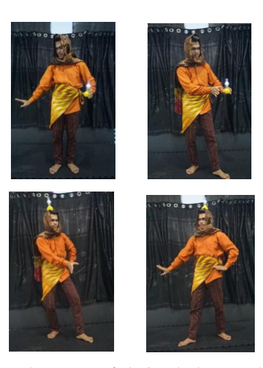
Figure 5. The process of placing the lamp on the head

The position of the left hand holding the teplok lamp is directly in front of the chest, the right hand is parallel to the chest and then swings forward and backward. The heel and tip of the right to point to the floor alternately. Then, it is placed on top of the head