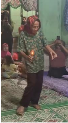
Figure 2. Spinning Process