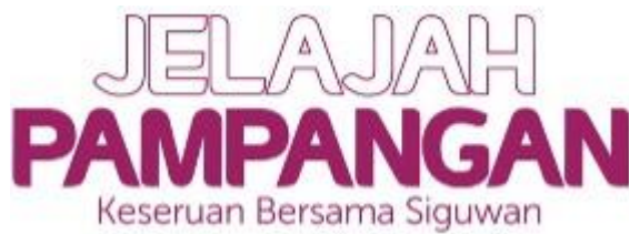
Figure 3. Logotype with a tagline without a logogram

that is open to new things. This font is used as a tagline font and bodycopy font for the text on the media used.