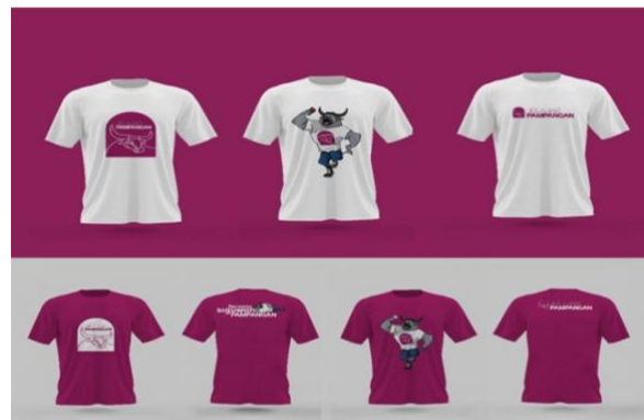
Figure 5. "Exploring Pampangan" T-shirt

T-Shirt is a physical attribute. Used as a medium for activating the brand, which is given as a follow-up medium, it reminds us of the visual branding "Jelajah Pampangan" as an educational adventure destination. The logo is applied to the t-shirt to introduce the visual brand of the gastronomic tourist destination "Guwan" Gulo Puan in the Pampangan sub-district. The t-shirt uses white cotton combed 30s and disco.