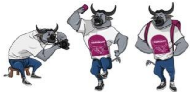
Figure 4. Siguwan character

in height and width adjusts to be printed as an icon of the Pampangan sub-district. Placement of the Siguwan miniature, placed at the Gulo Puan production site as a souvenir from the Pampangan sub-district. Meanwhile, the Siguwan icon is placed at the position of the main gate when entering Pampangan District.