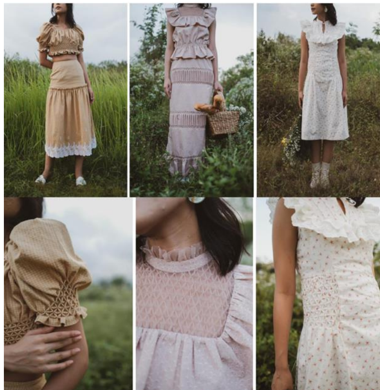
Figure 5. Final garments

Once paper patterns were adjusted after reviewing the toile samples, final garments were then produced complete with each design features (Figure 5).