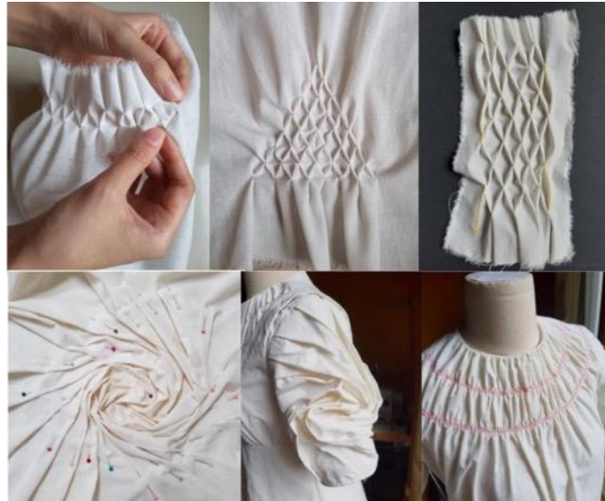
Figure 4. Fabric manipulation and pattern exploration