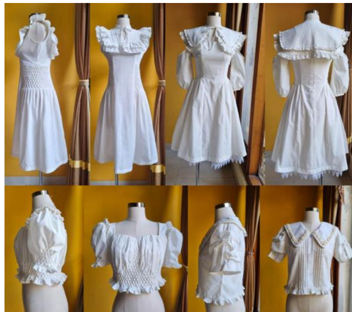
Figure 3. Toile samples

conducted. Figure 4 shows the exploration of smocking technique and puff sleeve to serve as one of the design features and shaped into rose-shaped puff sleeves for one blouse.