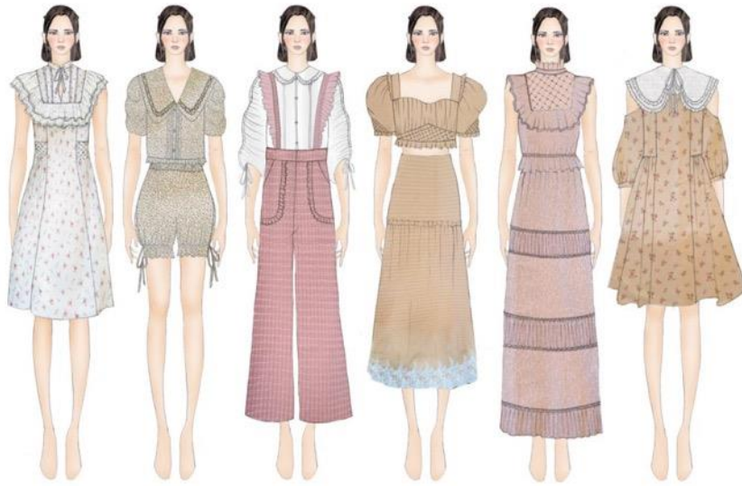
Figure 2. Six-looks line up

up as depicted in Figure 4 strived to be bolder in experimenting with silhouettes, cuts, and lengths based on the results obtained from consumer interviews. More consideration was given to trimmings while retaining the cottagecore essence, such as the use of embroidery for the edges of the hems and ruffles in certain parts for accents. Apart from seeking more innovative materials, the second development process was also carried out coinciding with fabric and material research, and thus the designs were also more concentrated.