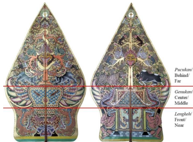
Figure 1. Wayang Kayon Filling Landscape Structure, photos and modifications by Pramudita, 2021

The landscape shown on the Wayang Kayon filling structure of the pucukan shows a panoramic view of the mountain with a stretch of forest enveloping it. This is related to the mountain perception on Wayang Kayon figures, as well as reinforcing the term gunungan uses to designate Wayang Kayon figures. Although all traditional Wayang Kayon figures have the same landscape at the pucukan , the composition in the genukan and lengkeh sections shows differences in perception.