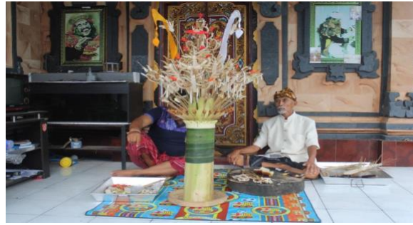
Figure 1. Sate Renteng or Jerimpen in the Baha Tourism Village

If a comparison is made, joint sate in the marriage ceremony carried out by the people of Baha Tourism Village is not the same as sate renteng in the implementation of the dewa yadnya ceremony. Sate renteng at a wedding ceremony in Baha Tourism Village is sate renteng as a complement to the nekaang ceremony consisting of tumpeng pitu , tebasan , jerimpen , jaja and gebogan which are presented to the bride and groom the day before the Galungan holiday or at the time of Galungan ceremony. Sate renteng made by the family/relatives of the bride and groom from both male and female families for the bride and groom. Sate renteng before being offered to the bride's house, the sate jointly is first released by the maker, and during the Galungan holiday, the sate renteng in the form of a jerimpen is arranged by the bride and groomed by the sonteng holder. Sate renteng in a marriage ceremony in Baha Tourism Village is made on banana stems as shown in Figure 1.