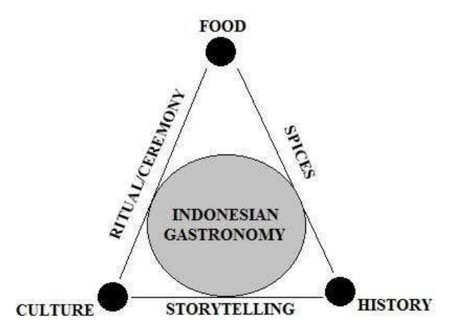
Figure 2. Triangle Concept of Indonesian Gastronomy, UNWTO

(UNWTO, n.d.) shaped by a mixture of cultures. These three points become the main platforms in the creation of strong narratives about food culture, with the main goal of achieving authenticity, locality, and novelty in the tourist experience (see Figure 1).