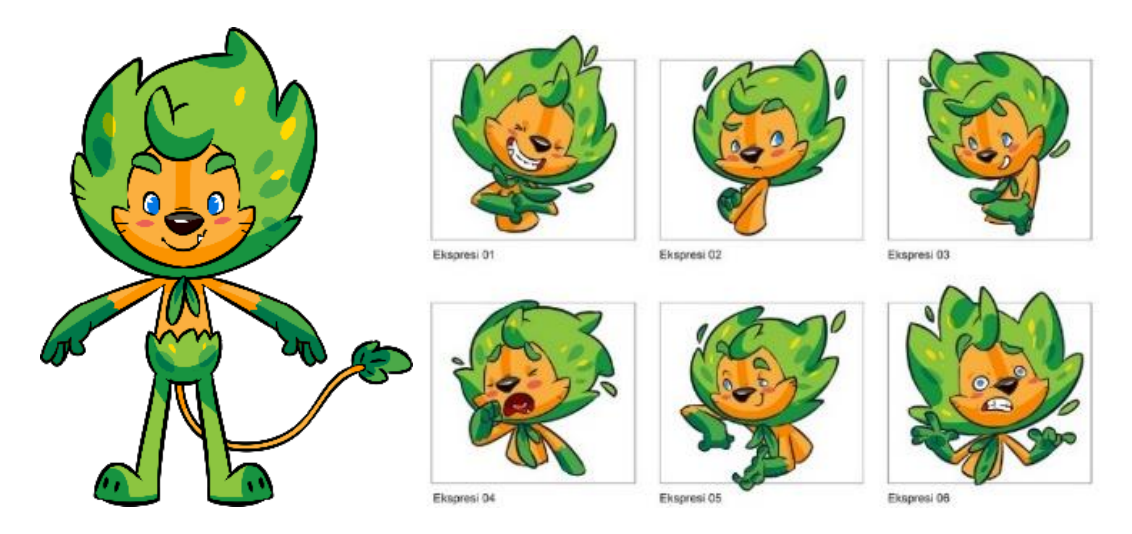
Picture 2. The visual of expression variety of Osi

Osi is illustrated to have green-clad legs wrapped in what appear to be like trousers, maybe for the decency factor that I met to be the character of Malang citizens. The hands have four fingers like an ape, so it has the ability to grasp and add the diversity of gestures. This part of the hand also looks like wearing gloves.