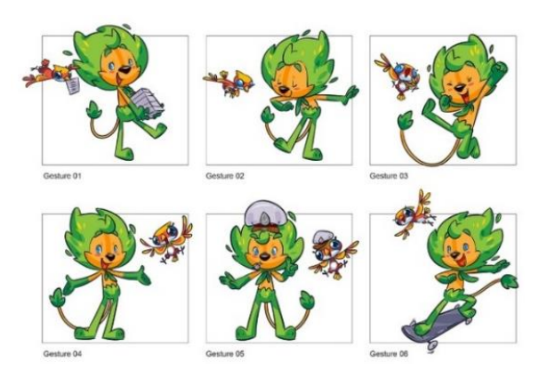
Picture 5. Variety of visual gesture of Osi and Ji

from the word "iso" which means "can" (Javanese language) with local dialect of Malang. The spelling of Malang's Walikan language is written and read from the back like reading Arabic letters (right to left). In daily conversations the pronunciation is usually adjusted to be more easily spoken, so it must not necessarily from the back to front. It is sometimes encountered that this Walikan language does not only use words from Javanese but also from Indonesian, Arabic, Madurese and Chinese. The main point of Walikan language of Malang is the consensus that formed at the time the word was used. While the name Ji comes from the word siji (Javanese language) which means one. So if it is combined, the meaning of Osi and Ji means iso dadi siji, or "can be one" (united). This also becomes the characteristic of Malang people which are always harmonious, united, cooperative.