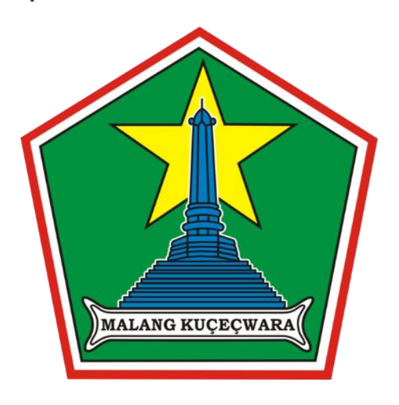
Picture 4. The symbol of Malang dominated by green which symbolizes the beauty of the city

The symbol of education is manifested in Osi's figure in the form of a tie worn by scout boy (hasduk) and in the coloring of the eyes of the two figures that is sky blue. The dominant green color reflects beauty which is in accordance with the logo of Malang city. Osi's figure is depicted as the embodiment of lion with a leaf woven mane, at the tip of the tail, leaf shape is depicted more clearly. In his explanation, Papang reveals that Osi's mane is the home to Ji, the Manyar bird. Further, Papang's creation also raises fictional story about Osi's figure which is inspired by the shape of the statue on Kidal temple.