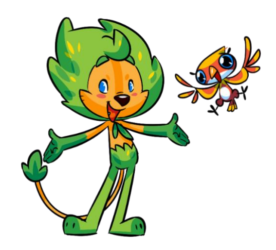
Picture 1. Malang city's Mascot, Osi and Ji (Source: Papang Jakfar, 2016)

Aside from being discussion this city mascot phenomenon eventually began to spread in Indonesia. This can be seen from the emergence of the mascot of Surabaya city in 2015 and the mascot of Malang city at the end of 2016. And for the first time mascot was inaugurated as the identity of a city in Indonesia namely in Malang as an effort to promote tourism and distinguish the city. The mascot of Malang city is created by Papang Jakfar who won a contest held by ADGI Chapter Malang in cooperation with the government of Malang. City mascot created by Papang Jakfar takes form of two figures, namely lion and Manyar bird, and given the name Osi and Ji. This mascot's use was officially started in coincidence the 103rd anniversary of Malang.