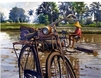
Title: Kerigat Size: 106 x 76.0 ,Media: Watercolor