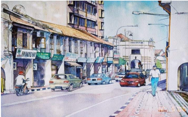
Work research 3:

Title: Alor Setar III (Jalan Langgar) , Tahun: 2002 Media: Cat air Ukuran: 27.0 x 38.0 cm oleh Ahamad Fauzi bin Hassan