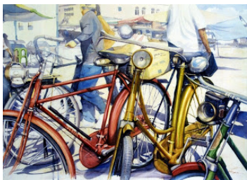
Title: Gelagat, Size:74cm X 54cm, Media :Watercolour