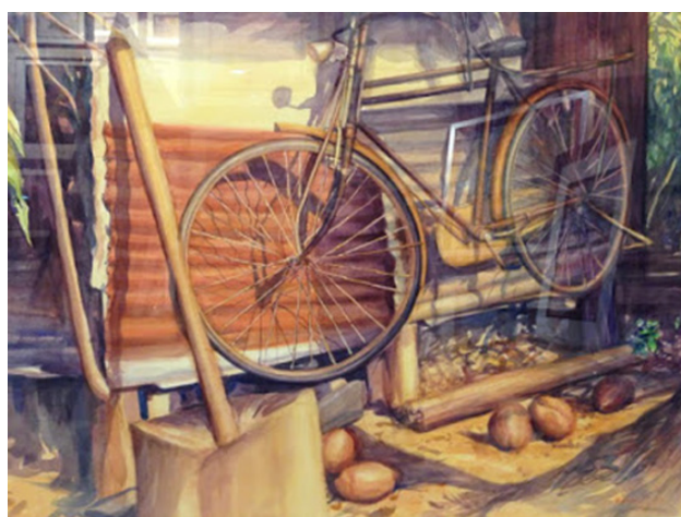
Work research 1:

Title: Gerek Di belakang Rumah, Year: 2008 Media: Watercolor Size: 106 x 74.0 cm by Rohaizad Shaari