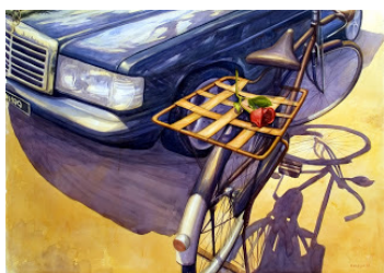
Title: Darjat,Size: 153cm X 110cm, Media:Water Colour