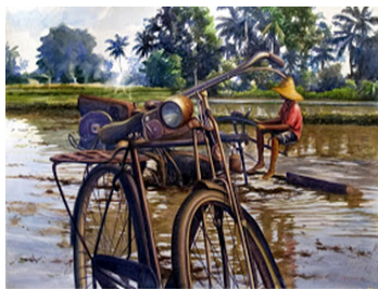
Title: Kerigat Size: 106 x 76.0 ,Media: Watercolor