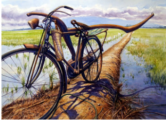
Title: Pupus Size: 105 x 75.0 ,Media: Watercolor

to be a current trend that leads to the assimilation of painting art based on the use of traditional images through contemporary objects. This is because of the use of visuals such as figures, fauna and flora in each of his works that cover the cultural elements of the state of Kedah itself.