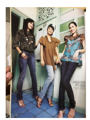
Figure 8. Batik cloth as material for blouse, Danar Hadi collection combined with pair of jeans showing its semi-casual image (Femina, 2004)

Changes in batik clothing in women's clothing styles in Indonesia also indicate the existence of the development of the batik industry and the fashion industry, which is now part of the creative industry that receives special attention from the government. Changes in world trends related to sustainable design, environmentally friendly design, and ethical to the natural environment and the human factors involved, encourage the recognition of batik as a traditional cloth by various groups in Indonesia. With the support of a variety of events related to fashion shows and exhibitions that elevate batik, it can be predicted that batik