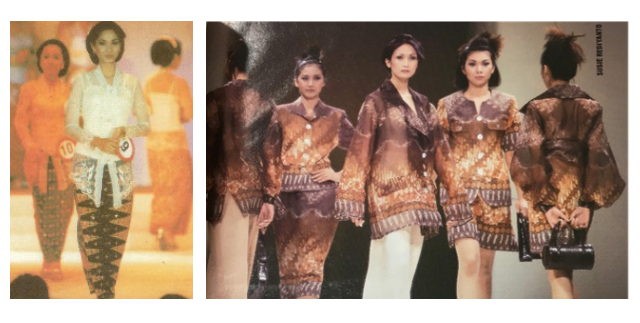
Figure 6 . A combination of batik sarong and kebaya worn by Indonesian women's competition finalists in 1986 (left). Printed batik textiles used in fashion show event by designer, early 1990s (right). (Femina magazine 1985 and 1995 edition)

Changes in the function of batik cloth in Indonesian fashion style also represent changes in clothing needs for Indonesian women. In the period before ethical politics (1900), women worked more at home. However, after that time, Indonesian women began to do activities outside the home, both for work and education. In the following periods, Indonesian women's fashion styles have been increasingly developed along with technological developments in the production of textiles and clothing as well as information technology, which allows fashion trends in other parts of the world to influence fashion styles in Indonesia.