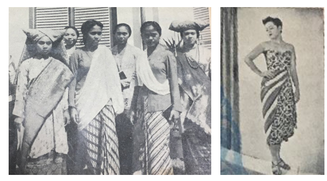
Figure 4. Pictures in one of Puspa Wanita magazine's edition on how to use batik cloth in two different ways (Puspa Wanita, 1956)

One example was the pattern drafting of batik clothing for mothers and children, which in terms of silhouette and clothing construction did not resemble the clothes of Indonesian regions, but in the form of pieces of silhouette A dresses that were influenced by European women's clothing at that time. Regarding the influence of the dress, Zaman (2001) argued that this was a depiction of the romantic atmosphere of a cheerful young woman at that time, with dress pieces known as dirndl. This fashion style was influenced by the modern atmosphere of young people at that time that began to be influenced by jive, rock n roll, cha-cha and cha dancing activities.