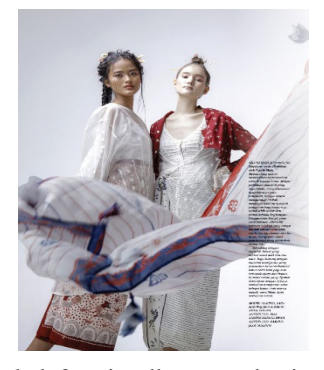
Figure 7. Batik cloth functionally returned to its root (see Figure 1 and 2), made by emerging designer, Chitra Subijakto for Sejauh Mata Memandang brand (Dewi magazine, 2019)