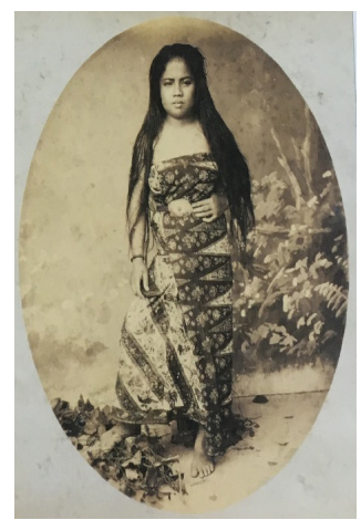
Figure 3. Sarong used on the chest like kemben (Smend, 2004)

Meanwhile, in the next decade of the 1990s, printed batik textiles began to be widely known and used by design-