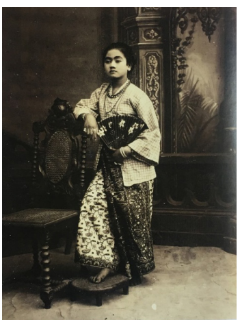
Figure 2. Sarong used by a servant around 1870 with kebaya as top (Smend, 2004)