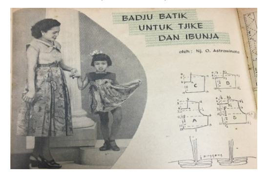
Figure 5. One of Puspa Wanita magazine's edition shows pattern for mothers and children clothes made of batik cloth (Puspa Wanita, 1956)

ers. This made it easier for people to obtain and wear batik cloth. However, this also led to the interpretation that printed batik was batik cloth. Widespread awareness of the public about batik cloth was marked by UNESCO's recognition of batik cloth as the UNESCO Representative List of the Intangible Cultural Heritage of Humanity in 2009, which also started the commemoration of the National Batik Day on October 2 each year. In the same period, batik was revived again with the emergence of the trend of sustainable design. Batik was considered as one of the textiles which in some instances conformed to eco-fashion criteria, especially slow fashion and ethical fashion (Ratuannisa, 2016).