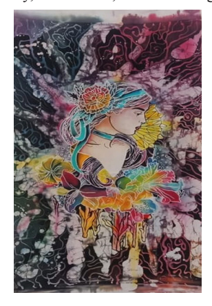
Figure 6. Reflection, 100 x 50 cm, Batik Painting on Fabric

aspect, including the shape of the main icon, supporting icons, and the colors used. The interpretation of the meaning of the resulting artwork is in accordance with contemporary icons chosen to represent the philosophical meaning of the Kawung batik motif.