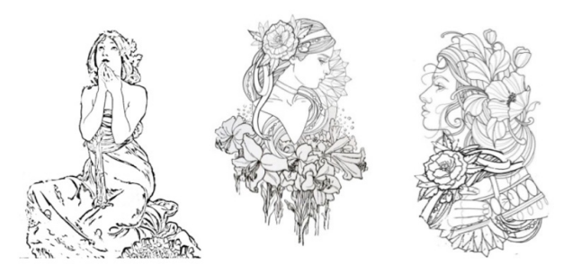
Figure 2. This sketch is inspired by the philosophical meaning of the Kawung batik motif which contains the meaning of controlling lust, respecting nature, and always remembering God

Understanding Javanese women can be seen from the terms used to refer to women, namely Wadon, Wanita, Estri, and Putri who philosophically have noble meanings. The Wadon comes from the Kawi language (Old Javanese) Wadu which means servant, so in this term, it means that women are natural servants of men. The woman is formed from two Javanese words (Kerata Basa) Wani which means brave and Tata which means regular. This base has two different meanings. Wani is arranged which means brave (willing) to be regulated. while Wani Nata, which means to dare to regulate. Thus, the word woman implies that in addition to being able to be regulated by her husband or man also has a role to manage the household, especially in educating their children. Estri comes from the Kawi language: Estren which means Panyurung (pusher). The meaning of this term is that women can be a driver for men. As in the saying that "there are always great women beside great men". Putri, in traditional Javanese civilization, this term is often expressed as an acronym for the words "Putus Tri Perkawis", which refers to the post-re-