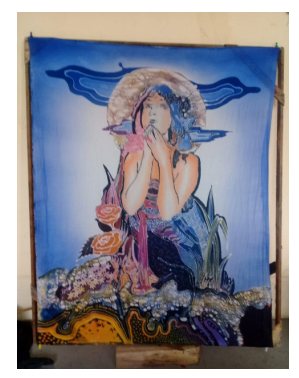
Figure 5. Pray, 90 x 75 cm, Batik Painting on Fabric

In this article, three batik painting is described through the above process. Each work is described from its visual