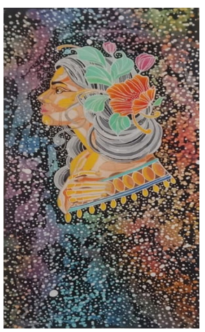
Figure 7. Staring, 80 x 50 cm, Batik Painting on Fabric

mal aspect of this work of art consists of the main icon of a half-body female figure complete with clothes, jewelry, and a crown of roses on her head. The position of his head was looking down with his eyes open. On the body is decorated with a variety of colorful flowers. The supporting objects are clouds-like shapes placed on the background. The colors in this artwork are dominated by brown and purple in the background. While the complementary colors are red, yellow, blue, green, orange in the forms of flowers that adorn the body. The head icon that bows with blank eyes represent an attitude of contemplation to control lust. While the dark color on the background represents a calm inner atmosphere. In general, the idea of creating artwork is in harmony with the philosophical meaning of the Kawung batik motif, about self-reflection to always remember God and control worldly desires.