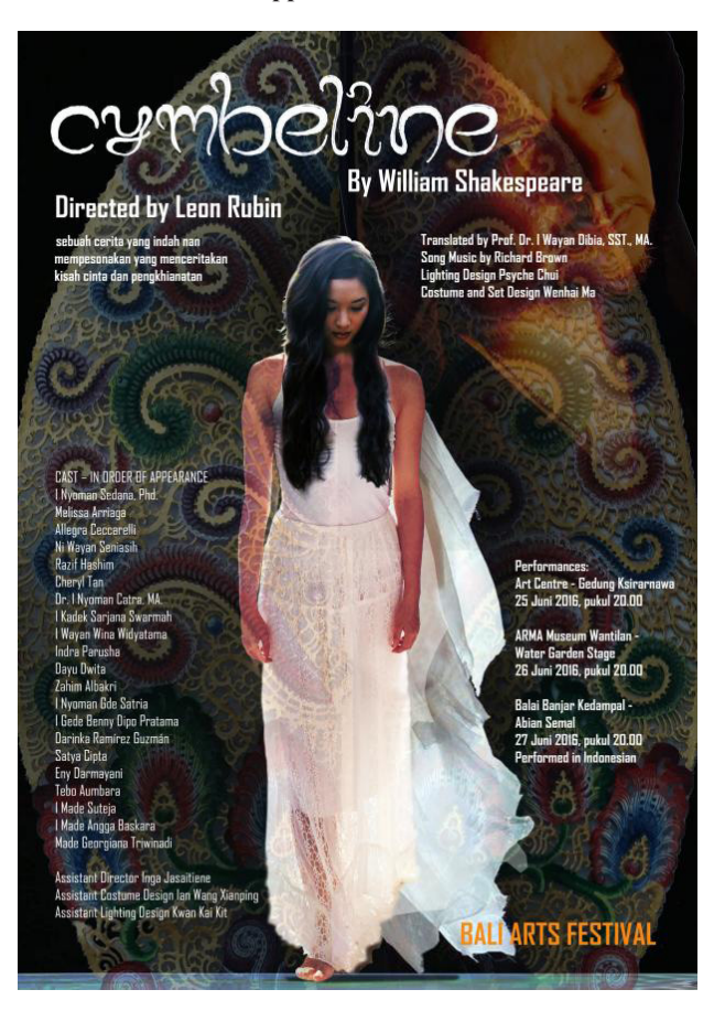
Appendix 2. Poster