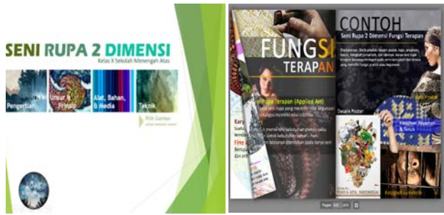
Figure 1. Preview of I-Spring-based learning media display indicating the diversity of archipelago local two-dimension fine art products

affect objective reality in internalization process. Externalization is defined as adaptation to socio-cultural world as human product. The externalization process the human beings experience as the requirement to pass through the process to become human, through evolution over times. It is just like a child originally experiencing primary socialization only, and going outside to secondary socialization (outside friend and playing role), should “put” himself to outside world, in the attempt of actualizing himself later (Berger, 1991).