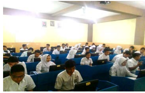
Figure 2. Process of internalization of local wisdom through learning-based computer technology I-Spring