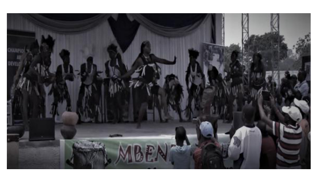
Figure 8. Ngomadzepasi Dance Ensemble performers standing in an arc form whilst a girl performs inside the arc.

Other traditionalists and the junior drummers claim that multiple drums are better than two in terms of the quality of sound and rhythm. Most performers feel that this element adds value to the overall substance of the dance