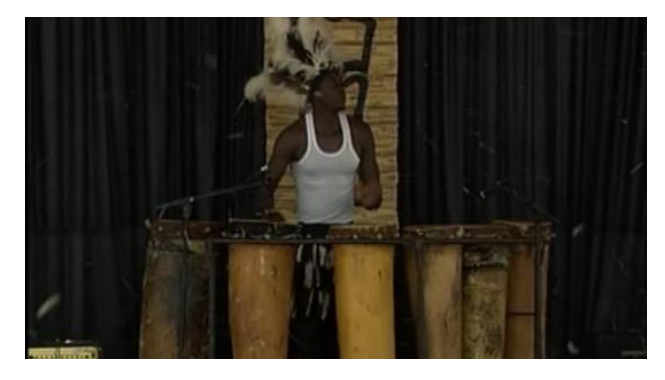
Figure 12 . Makarekare master drummer playing six drums during the Annual Jerusarema/Mbende Dance Festival, 2015.

Yodelling is also one of the authentic elements of Jerusarema/Mbende dance listed in the UNESCO ICH file and is noted as only being performed by women. Yet, the videos of different ensembles performing at the Annual Jerusarema/Mbende Dance Festival show all yodelling is led by a man. First, a single male singer starts the yodelling and then the women yodel together with him. During interviews, all Jerusarema/Mbende dance practitioners mentioned that all the performers are involved in yodelling and stop during the active session of the dance. However, one of the elements only performed by women is ululating, which is not mentioned in the UNESCO ICH register. A high-pitched trilling sound of ululating is made during the active session to praise the dancers. The authors of this article believe there was misinterpretation of this element. Instead of noting yodelling as only being performed by women; it should be noted that ululating is only performed by women.