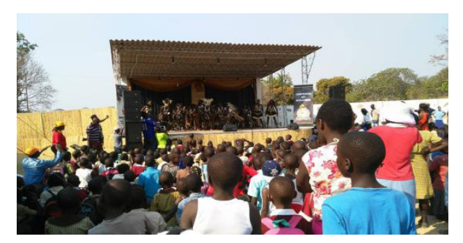
Figure 5. Raised stage used by performers at the Annual Jerusarema/Mbende Dance Festival.

parcel of Jerusarema Mbende cultural material (see Figure 4).