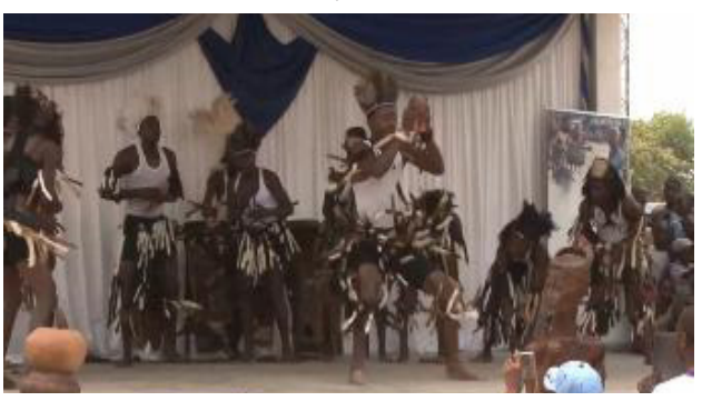
Figure 11 . Ngomadzepasi wood clappers showcasing their skills during the rest session at the Jerusarema/Mbende Dance Festival.

lyrics, for example 'Tirikutandara' (We are Relaxing) or 'Yarira Ngoma' (The Drum is Beating), give meaning to the dance. For instance, the song 'Yarira Ngoma' gives the audience some idea of where the dance comes from. Therefore, performers' interest becomes a priority. The safeguarding of the Jerusarema/Mbende dance may be diminishing as UNESCO cannot control the interests of the various ensembles.