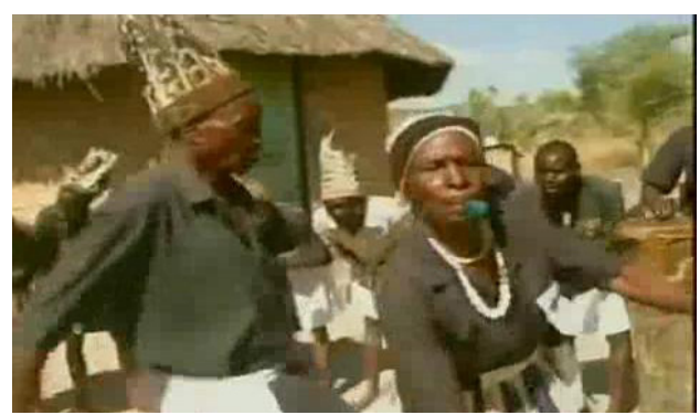
Figure 4 . A woman performing Jerusarema/Mbende dance whilst blowing a whistle. Source : screenshot from video recorded for UNESCO nomination file, https://ich.unesco.org/en/RL/Mbende-Jerusarema-dance-00169

Apart from context, the choreography is also an important characteristic in Jerusarema/Mbende dance. Per Fos-