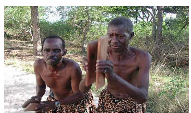
Figure 3 . Men playing wooden clappers during a Jerusarema/ Mbende dance demonstration performance.

in 2017 concur that Zimbabwean performance contexts currently include recreational centres, political gatherings, competitions, and festival arenas.