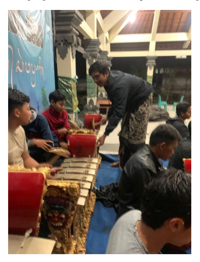
figure 3. Meguru panggul