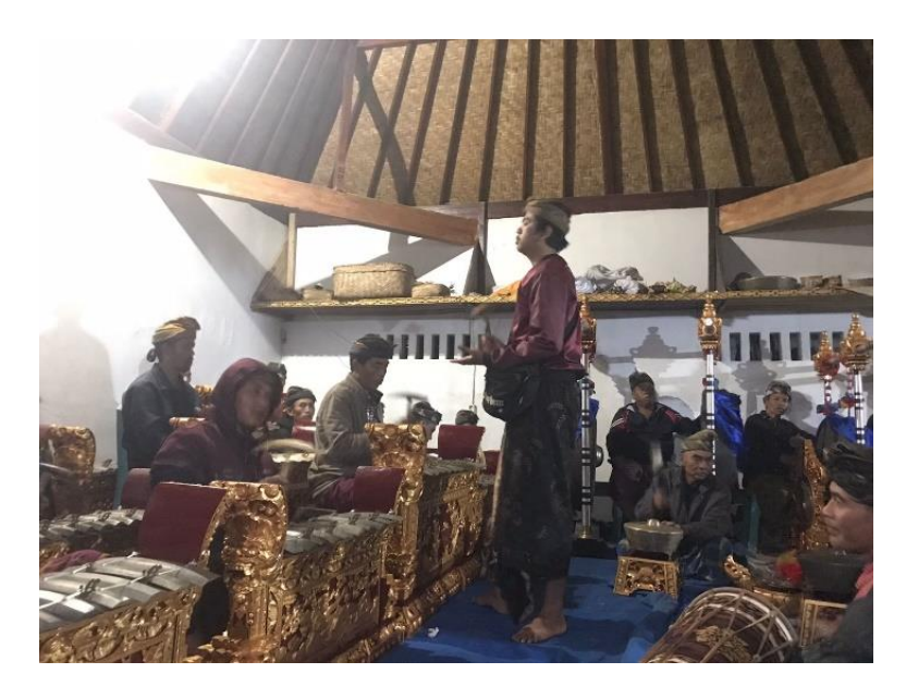
Figure 1. Training on the work of tabuh telu Sekar Japan

The author carries out several stages in forming the composition of tabuh telu Lelambatan (Hood, 2010) entitled Sekar Jepun. This KKNT activity is required to make works as community service, where this work can be performed when there is a religious ceremony in Ulian Village. The stages carried out are as follows: