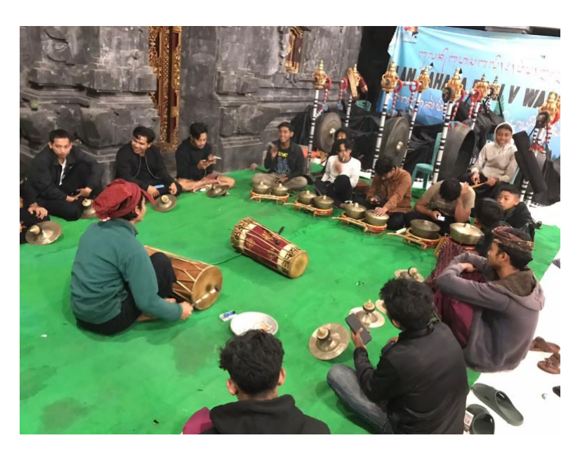
Figure 2. Gives an example of a drum punch

This exploration stage is the first step in carrying out the process of cultivating a work of art. In realizing works of art, there needs to be careful thinking, stages, or planning starting from the search for an idea and other considerations which can be used in making works of art. At this stage of exploration, the author is looking for an idea in the development of works of art, where the formation of works of art must be based on ideas or concepts; in this tabuh telu , the author is inspired by frangipani flowers, where this frangipani flower has a very good beauty and fragrance, from this the author tries to take ideas from the beauty of frangipani flowers and the fragrance of frangipani flowers to be poured into gamelan tabuh telu lelambatan .