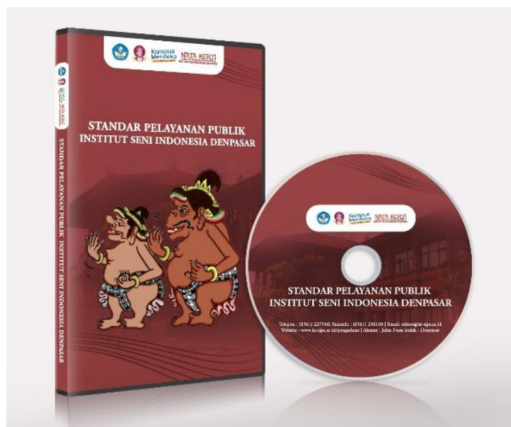
Figure 3. Design of DVD labels and packaging of Interactive media

After completing the interactive media, the team then designed the label and DVD cover to make it look attractive