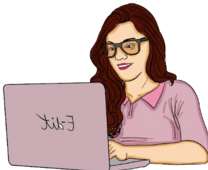
Figure 2. The character used for the interactive media of eight standard of public service on bureaucratic reform at the Indonesian Art Institute Denpasar

The characters used in the interactive media standard public service procedures in bureaucratic reform at the Indonesian Institute of the Arts Denpasar are a combination of wayang characters wrapped with modernization elements and packaged with a little cartoon nuance. These characters chosen to seem humanistic, in accordance with Balinese culture, and adapt to the characters used in several visual communication media from information on the application of eight public service standards at the Indonesian Institute of the Arts Denpasar. However, what makes it different from the previous characters, where the characters used in this interactive media character are made in their entirety from head to toe and the characters are used in colour. The characters used are the puppet characters Merdah and Tualen , where the Merdah character is designed to represent the community or someone who wants to get information. Meanwhile the Tualen character represents the staff member who provides services to the community, as well as four other characters such as the Condong dancer character who represents female visitors, then the character of the editor, the character of a bank teller and the character of a reviewer.