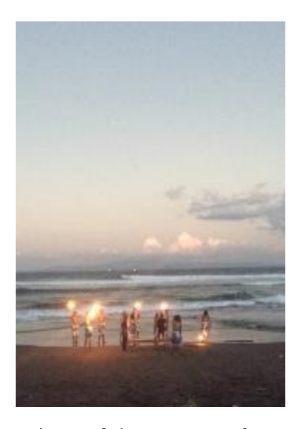
Figure 5 Pering Beach

Pering Beach was chosen based on the wide exploration space of the beach and the black sand of the beach. With black beach sand, the image of the dancer's reflection on the infiltration of the waves in the sand will be easily obtained. The beach will also support images related to the attraction of the Kecak dance and also the natural charm.