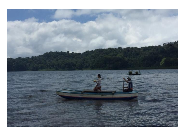
Figure 6 Tamblingan Lake