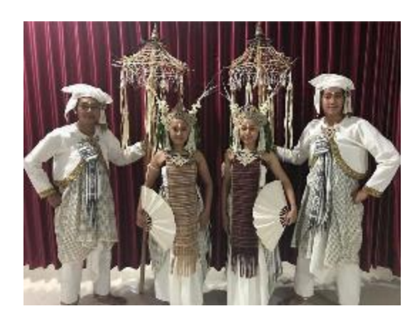
Figure 2 Wardrobe

Wardrobe played a vital role in the production of this Mahakrya Lango film. Some wardrobe needed is related to Balinese dance clothes. This is what makes the choice of wardrobe must be right in accordance with the structure of the story. For smooth production, the production team decided to cooperate with a dance studio. Dance studios are very necessary for this production process, in addition to getting wardrobe more easily, dancers and dance choreography were also needed. Based on the results of a long discussion and survey, the production team finally chose the Manubada Studio.