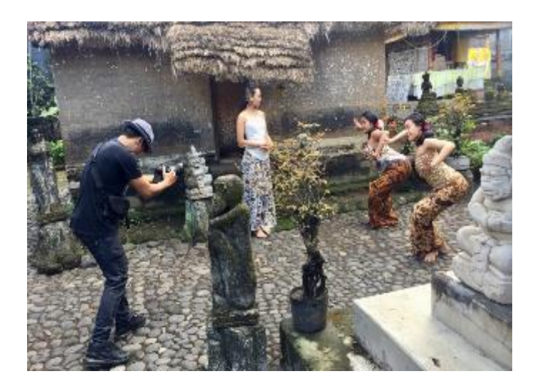
Figure 3 Old Stone House

Shooting in this old house was done to serve as a background for the story of the actor who is observing people who are learning independently in the old house. Based on the script that has been prepared at the beginning of the story, the main character enjoys observing people who are just starting to learn to dance.