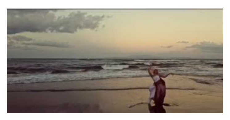
Figure 8 Pering Beach

The embodiment in the Mahakrya Lango film begins with determining the set of locations chosen, namely Lake Tamblingan to visualize water as a source of life, waterfalls to interpret flexibility and dynamism, and the location of the beach to describe celebrations. The flow of water is a symbol that was chosen to interpret several things in the life and culture of Bali. Water in Bali is not only a source of life but also a source of spiritual life.