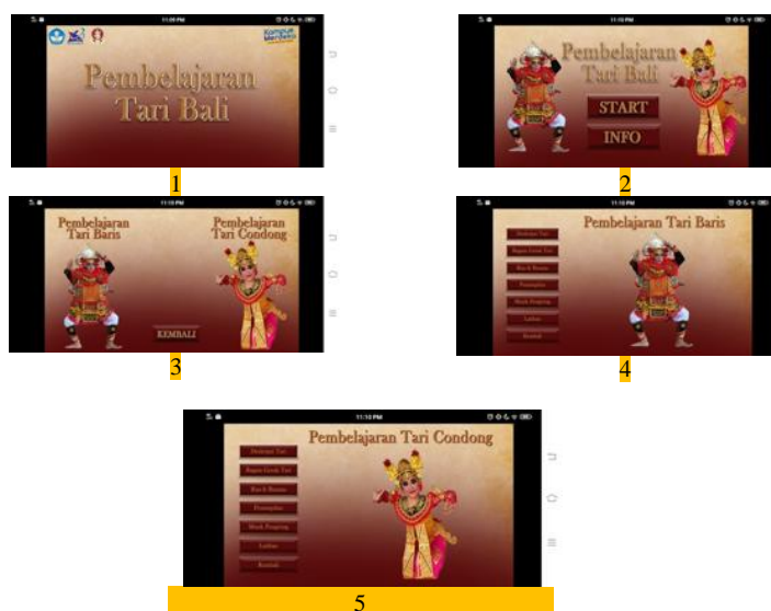
Figure 1. Display of learning media on android

Android Application Development Process with Software Constructs 2. Some of the pages on the Android-based learning media application have been created.