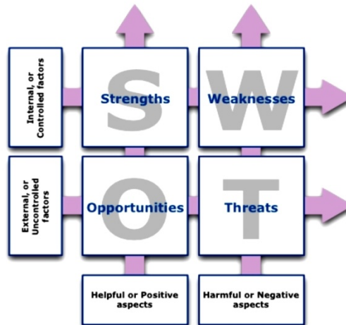
Figure 1. Basic SWOT Analysis Diagram (Sarsby, 2012: 9)

SWOT Analysis is a solitaire (individual) study model, in which the institutional principle used is 'internal interest'. The model is designed as a company evaluation tool in the context of competition and profit (Hill & Westbrook, 1997: 46). SWOT Analysis is a closed model. It positions other institutions or companies as threats. In the context of user development, analysis models must also be open to evaluation (Phadermrod, 2016: 194). SWOT analytical model was actually designed to increase 'profits.' However, it is now also commonly used as an analysis model for non-profit institutions based on "education equity". Nowadays, when the world of education is entering an era of openness, networks of cooperation, elaboration of strengths, and universities can open up opportunities for each other to become partners. Some points need to be reviewed when using SWOT Analysis for Higher Education, including: