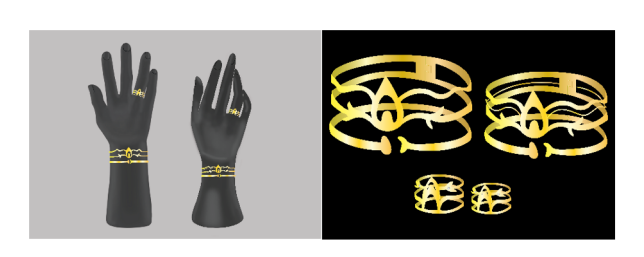
Figure 1.12 Jewelry Sets 2

Wedding jewelry sets make use of pre-made ornaments. The basic form of jewelry is a full circle on a ring and an open circle (type of bangle bracelet) on a bracelet. The purpose of the basic the shape of an open circle where the two ends of the bracelet seem to meet at one point is the reunion of Prince Panji and Dewi Sekartaji after going through an odyssey, while the full circle is a symbol of everlasting love, the same as the meaning of giving ring jewelry at a wedding ceremony which is a symbol of eternal/everlasting love.