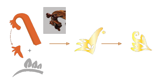
Figure 1.1 Evolution of the Set Form 1

Through the research that has been done by researchers on one of the relief panels that tells the intimate scene between Prince Panji Asmarabangun and Dewi Sekartaji with various supporting components in it, namely the vina musical instruments and various ornaments on the background of the reliefs that support the formation of a romantic atmosphere on the relief, the researchers then make various forms of ornaments that combine the formation of the vina musical instrument musical with natural ornaments and stylization of the shape of the line from the position of Dewi Sekartaji on the relief on the grounds that the three components (instruments, natural ornaments, and lap line stylization) are quite influential components in the depiction of the story on the relief. The following are the ornaments that have been designed: