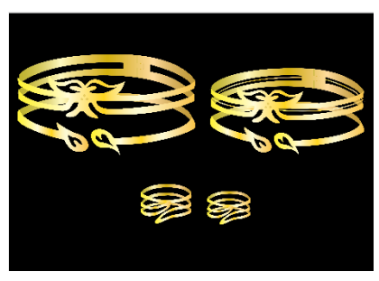
Figure 1.13 Jewelry Sets 3

Wedding jewelry sets make use of pre-made ornaments. The basic form of jewelry is a full circle on a ring and an open circle (type of bangle bracelet) on a bracelet. The purpose of the basic shape of an open circle where the two ends of the bracelet seem to meet at one point is the reunion of Prince Panji and Dewi Sekartaji after going through an odyssey, while the full circle is a symbol of everlasting love, the same as the meaning of giving ring jewelry at a wedding ceremony which is a symbol of eternal/everlasting love.