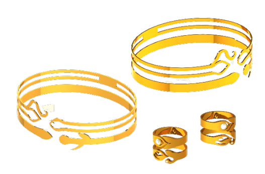
Figure 1.16 Men's Jewelry Sets