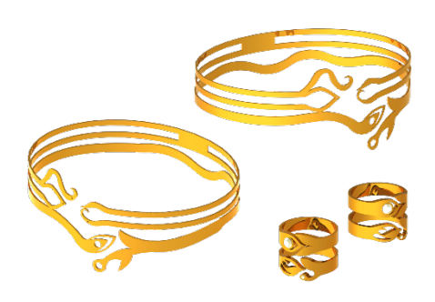
Figure 1.17 Women's Jewelry Sets

Based on the research that has been done, a prototype wedding jewelry set product with a stacking mechanism can be produced consisting of a pair of rings and bracelets. Indonesia has various kinds of reliefs, one of which is the Kendalisada temple, but the existence of the temple is starting to be forgotten and even many people do not know its existence. Times have changed and become modern. Therefore, to introduce and remind the public of the existence of the Kendalisada temple, a modern method is needed so that it can be accepted by the community. Seeing that today's society likes to follow fashion trends and invest, jewelry is a product that is widely used by modern society. Therefore, a jewelry set product for weddings was made as a medium to introduce this Kendalisada temple to modern society.