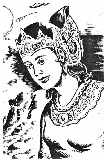
Candrakirana as Panji Semirang, The Female Bodied Feminine Man

perfect disguise of a woman, still as a feminine man, is taken for granted as possible.