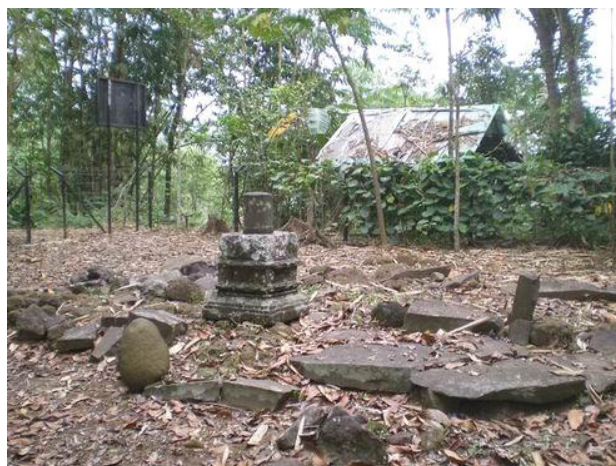
Figure 2. Lingga Yoni Kampung Sindanglengo, Sukamaju Kidul, District Indihiang, Tasikmalaya

Carl Gustav Jung formulates the collective unconsciousness as a universal element, derived from generations, not individuals. This element is very difficult to realize. The collective unconsciousness contains what he calls the archetypes. The three most important archetypes according to Jung are anima, animus and shadow. Anima is a female archetype in man, animus is a male archetype in woman, and shadow is animalistic archetype or also called the evil side of man. Other archetypes include archetypes of father, mother, child, hero, girl, wise parent, God, and so on. In this study, the discussion of lisung as the personification of women in the world's top in the world view of agrarian Sundanese, will be limited based on the archetype of mother, anima and animus. The archetype of mother is described as the innate abilities that exist in man over all matters relating to the maternal because every human being comes from an environment that involves the mother figure and role. Jung assumes that these innate conditions and abilities can be projected into a clearer world or figure. Even when the reference figure of mothering does not exist, humans will still concretize it by personifying archetype on mythical figure. Anima is a female archetype in man. And animus is a male archetype in woman.