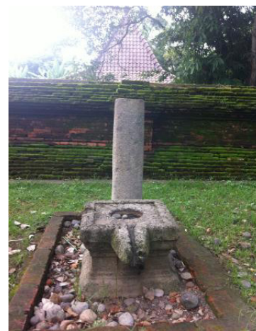
Figure 3. Lingga Yoni in the complex of Sitiinggil Keraton Kasepuhan, Cirebon

Here is a discussion of lisung-halu as the personification of woman in the mythical world in the world view of agrarian Sundanese, based on the three elements of archetypes, namely archetypes of mother, anima and animus. First of all, lisung-halu will be discussed as a form of collective unconsciousness. The collective unconsciousness can be described as a great psychological inheritance of human development, which is re-born. As the output of the collective unconsciousness, Lisung-halu is a legacy which is reborn from lingga yoni artifact. In West Java, Lingga Yoni Site is located on Jl. Blok Gunung Kabuyutan, which is administratively included in Wangkelang Block Kampung Sindanglengo, Sukamaju Kidul, Indihiang Sub-district