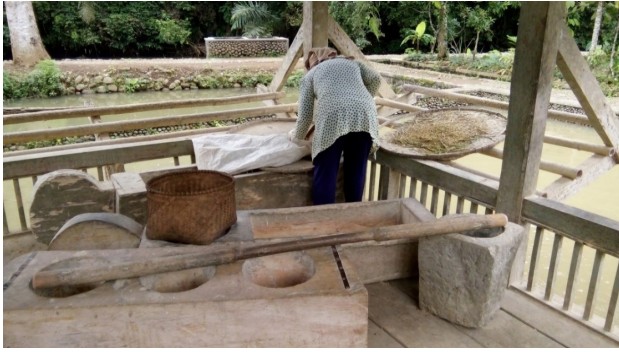
Figure 1. Lisung-halu and jublek in Saung Lisung Kampung Naga-Tasikmalaya