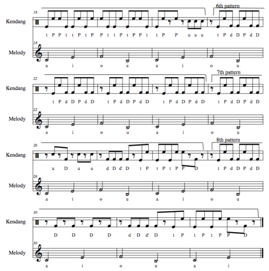
Fig. 5. Eight basic variation of kendang tunggal (CD Track 5)

The patterns in the first three cycles (measure 1 until 12) are related because they are developments of the first pattern [.tPu/.tPu/], adding different strokes one beat before. The fourth [PtPt/PtPt/] and fifth pattern [tPtP/PttP/tPPt/] in measure 13 until 21, are related as well, because the fifth pattern a development of the fourth one. The last three patterns (measure 21 until 33) are related to each other as development of the sixth pattern [.tPd/DP. D/].