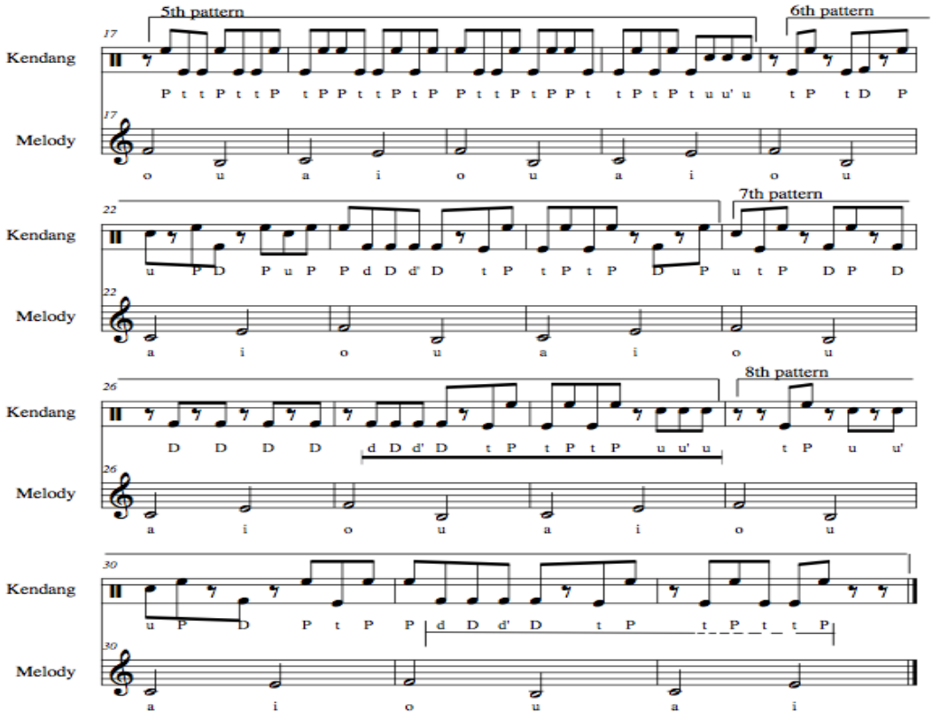
Fig. 6. Kendang tunggal improvisation based on the basic variation. (CD Track 6)

This improvisation part is obviously showing its motive relation to the basic variation part. In the third cycle (measure 9 until 12), those patterns [.tPu/.tPu/, .tPD/.tPu/, and .D.D/.tPu/] are chosen and arranged it in one eight beats cycle, and in the fifth cycle (measure 17 until 21), using the same pattern as the fifth pattern on the basic variation's part in figure 5 (measure 17 until 21). Some development of the pattern is added, like at the beginning through the second gong cycle and using this particular pattern [.dDd'/D.tP/tPtP/Puuu/] often used at the end of the segment. For instance: on the 6th and 7th pattern (measure 21 until 29), both are using this same idea of it ending (on the 6th one, showing the different at last beat after the gong). This is the idea of how kendang player develop their ability to improvise, by learning basic composed patterns taught by their teacher, and developing them spontaneously in the performance. However, experienced and skilled kendang player may not depend on basic variations. They usually expressed and used their