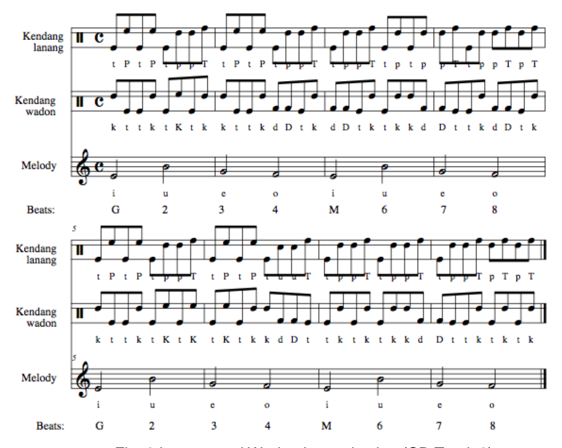
Fig. 2 Lanang and Wadon improvisation (CD Track 2)

This example shows improvisation in both parts developed from the basic variation shown in figure 1. As we can see in the lanang pattern, the sub pattern [tPtP/tppT/] is used at the beginning of the phrase, and elaborated in the part that is close to the end of the cycle, occasionally emphasizing the p and T strokes before the gong. The same thing is happening in the wadon part. The sub pattern [kttk/tKtk/] is maintained at the beginning of the phrase, but there are more variations happening in the middle part through the gong (last cycle). As mentioned above, lanang should really keep the patterns synchronized with the beat, in order to keep the beat stable and send a clear signal. Because of this, it would be inappropriate for the lanang player to play in a too-syncopated rhythm. However, in the less intense interaction with dancers, the lanang player will have more freedom to elaborate their patterns with syncopated rhythms.