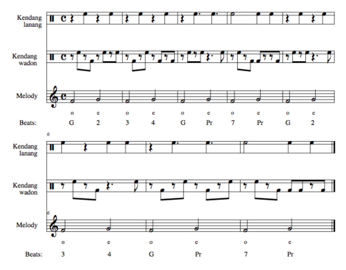
Fig. 4. Batu-batu improvisation (CD Track 4)